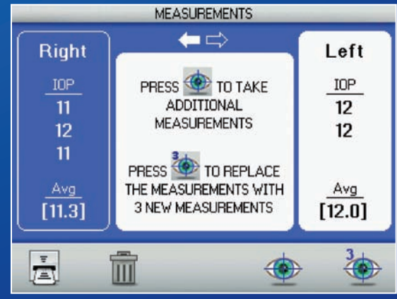
Clearly displayed measurement options and data