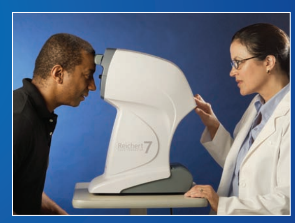
No joystick, chinrest or elevation controls necessary<sup>1</sup>